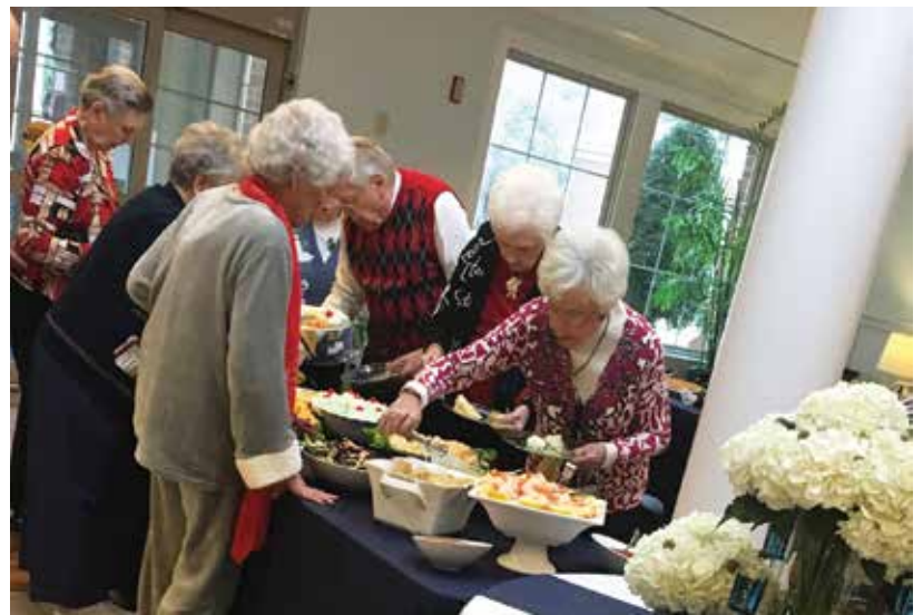
What a beautiful setting and an inviting Christmas feast! Residents enjoy the delicious food at the Laurel Crest Christmas party.