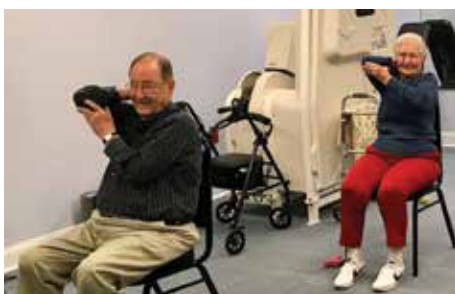
Left: Participants of the Half Hour Power class are excited to try out their new space.