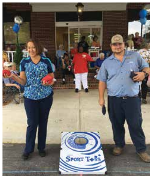
Serious play begins during the Staff Cornhole Tournament.