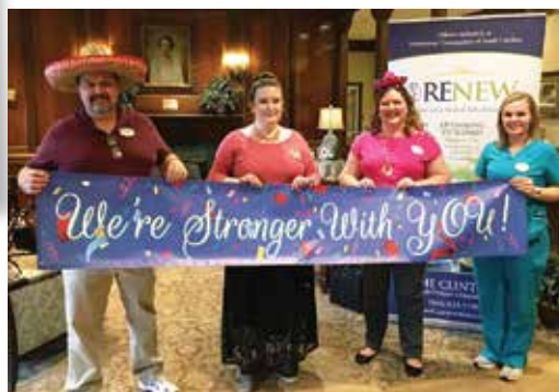
The new therapy team is ready to serve.