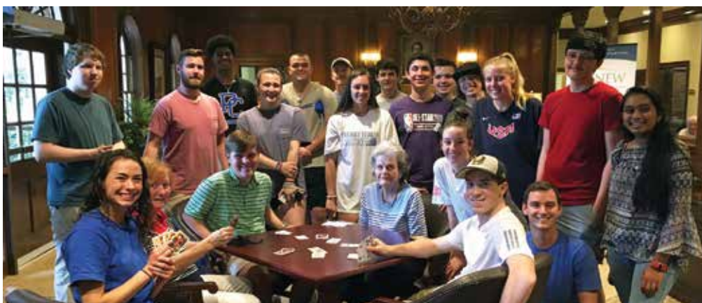
Presbyterian College students take a break from washing windows during a service day to play cards with a few residents.