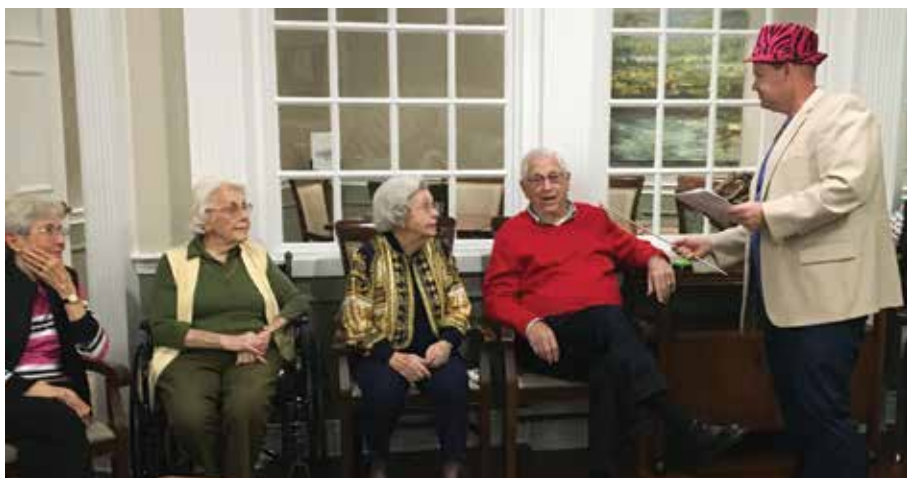
Florence residents enjoyed competing during a game of Family Feud.