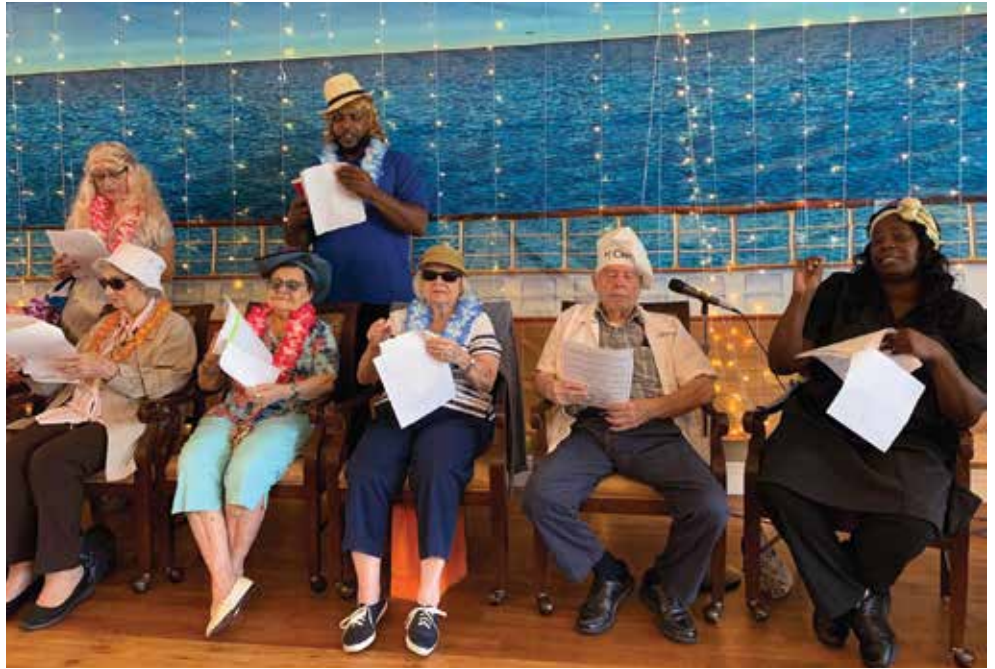
The High Seas Homicide cast delivered a great murder mystery!