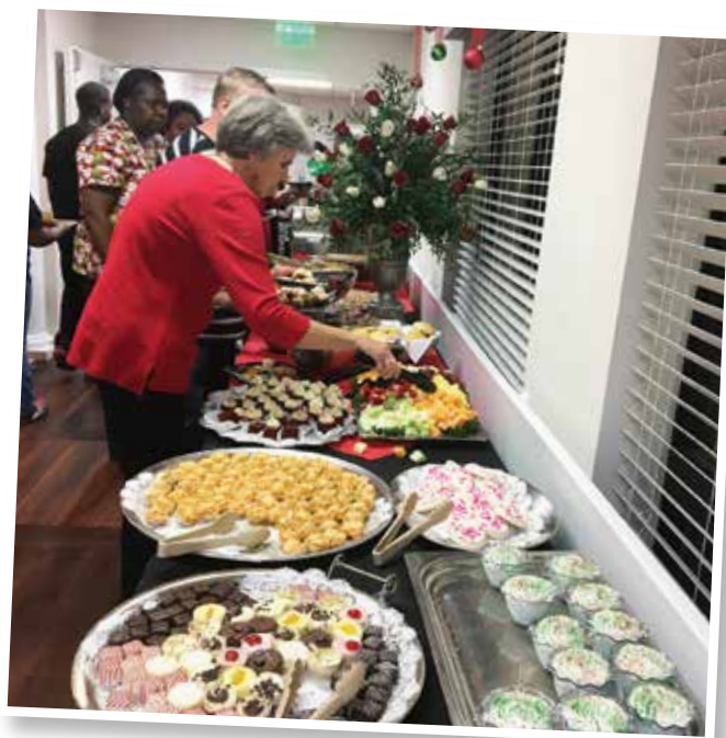
Delicacies were enjoyed by all at the Healthcare Center Christmas party.