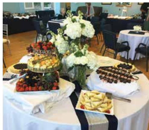
Dining Services provided culinary delights – all beautifully presented – for Laurel Crest's 25 th Anniversary celebration.