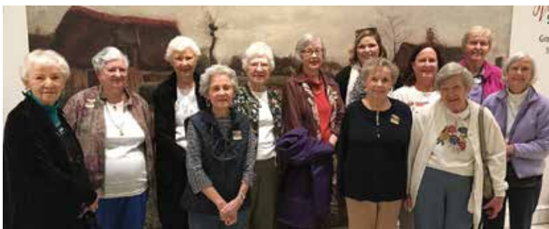
The Van Gogh Exhibit at The Columbia Museum of Art made for a great outing.