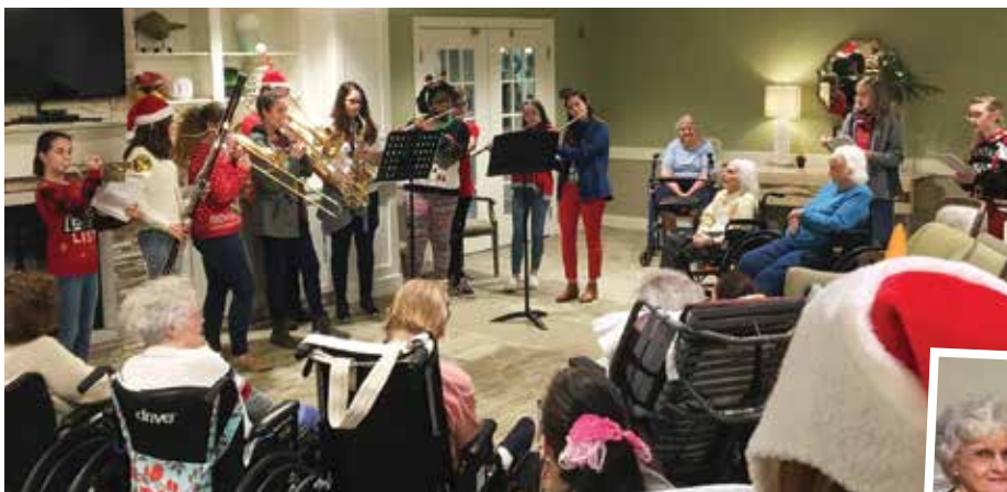
Cane Bay Middle School Band and Chorus perform in the Palmetto Unit.