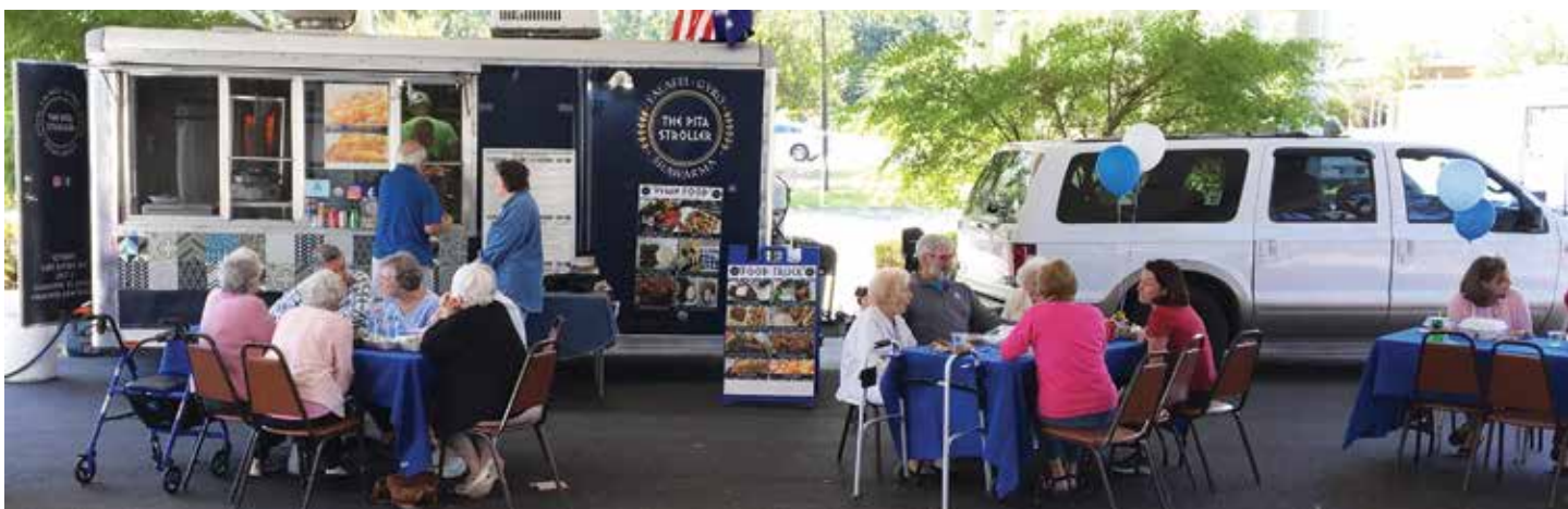
Below: Residents and staff enjoy the outdoors during Food Truck Friday.