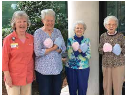
The Busy Fingers Group can't wait to deliver the baby caps they created.