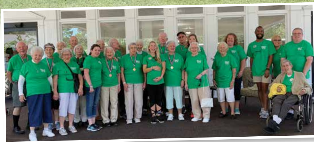
Everyone is ready for the Senior Games versus the Bishop Gadsden retirement community!